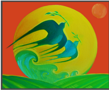
Community Action Board of Santa Cruz County, Inc.